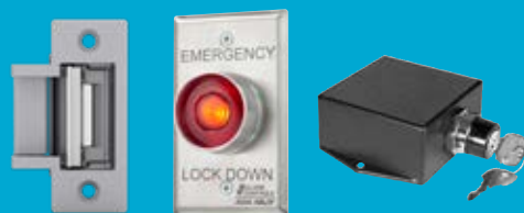
Alarm Controls Custom K-12 Solutions