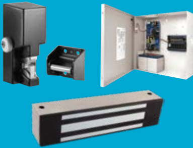
Securitron Electromagnetic Locks, Gate Locks & Power Supplies