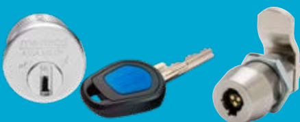
Medeco High Security Mechanical & Intelligent Keys