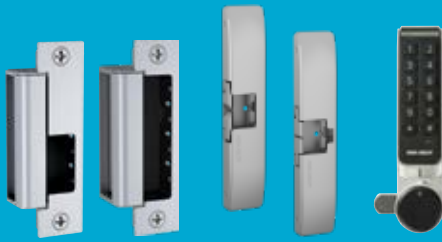
Electronic Security Hardware HES Electric Strikes & Cabinet Locks