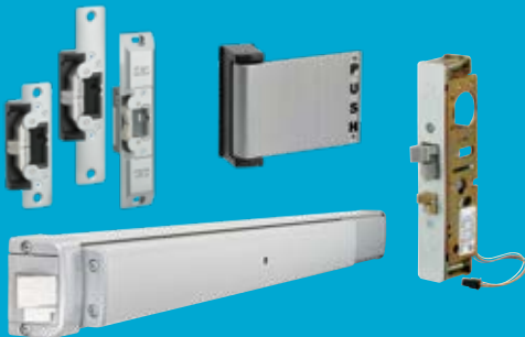
Adams Rite Exit Devices, Electrified Deadlatches, Electric Strikes & Trim